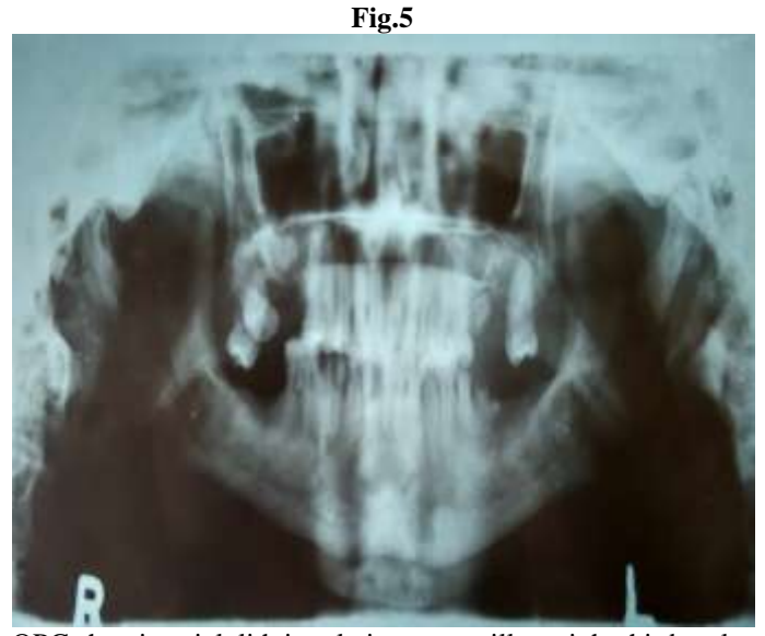
OPG showing sialolith in relation to maxillary right third molar