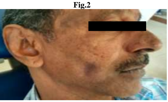
Lateral view showing a healed extra oral sinus