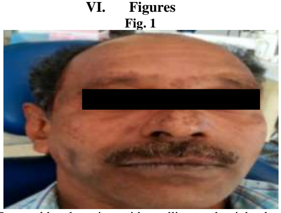
45 year old male patient with swelling on the right cheek

In conclusion, several options are available for the management of sialolithiasis, ranging from sialoendoscopy to ductal incision, and approaches combining sialoendoscopy with a targeted open approach. These options are all gland sparing and minimally invasive strategies. The use of one or another technique depends to a large extent on the sialolith size, location and composition. Gland excision is reserved as a last resort or in cases with multiple intra parenchymal sialoliths.